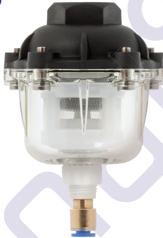
Part Number: 6100-023-AA

A 6mm diameter pipe can be connected to the base of the drain to control the flow of the discharged fluid into a suitable container for disposal.