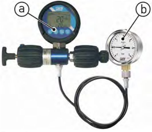
Example measurement setup

The pressure can be correspondingly reduced or completely relieved with the pressure relief value \bigcirc .